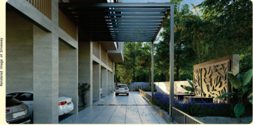
Rendered Image of Driveway