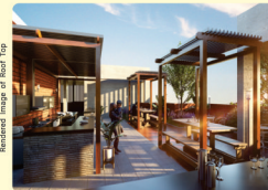
Rendered Image of Roof Top