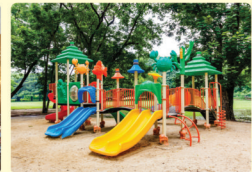
Rendered Image of Play Area