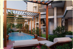
Rendered Image of Garden