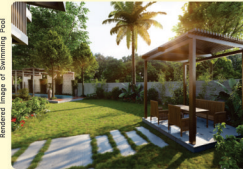
Rendered Image of Swimming Pool