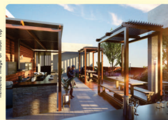
Rendered Image of Road Top