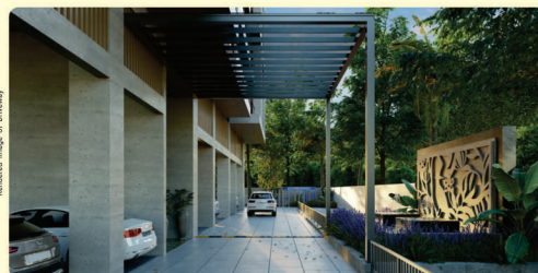
Rendered Image of Driveway