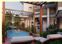
Rendered Image of Garden