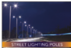
STREET LIGHTING POLES