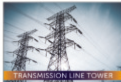
TRANSMISSION LINE TOWER