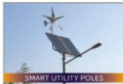
SMART UTILITY POLES