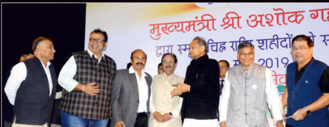
JCL Management Committee handing over cheque to Hon'ble Chief Minister Shri Ashok Gehlot Sahib of contribution for the families of Pulwama Martyrs.